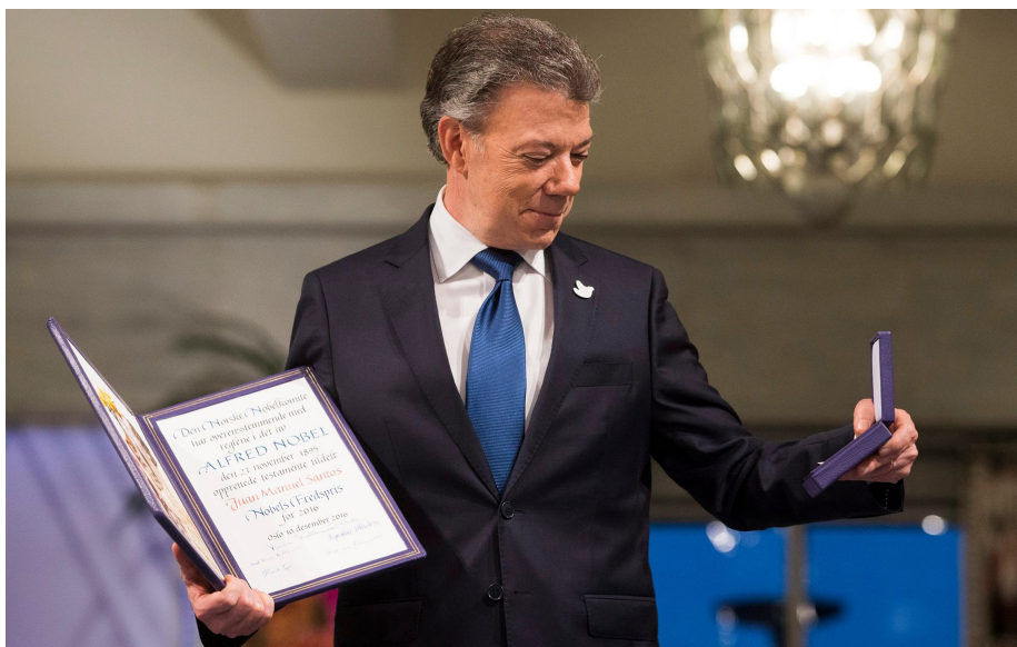
Colombian President Juan Manuel Santos (KU Class of 1973) accepts the Nobel Peace Prize in Oslo, Norway on December 10, 2016.