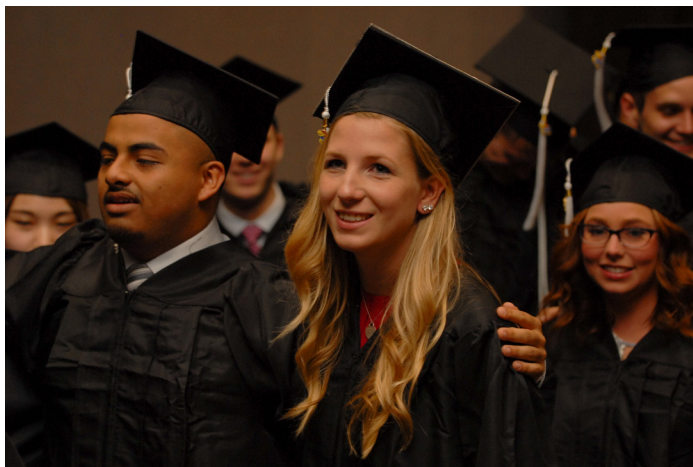
Class of 2016 graduates celebrate by swaying to the Alma Mater in historic Woodruff Auditorium.

Immediately following the program, students, families and friends are invited to a reception hosted by the Department at Alderson Auditorium.