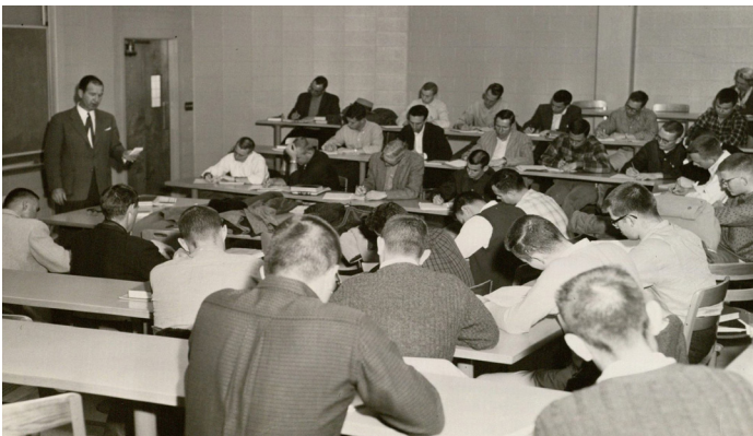
Economics lecture in March of 1960 in newly opened Summerfield Hall (Room 502).

Summerfield was in the news more recently, when its other longtime resident, the Business School, left in 2016 to move into its new home, Capitol Federal Hall. KU subsequently announced this February that a $10 million renovation will soon be underway to upgrade Summerfield for the purpose of housing KU's Department of Film and Media Studies, as well as several other offices.