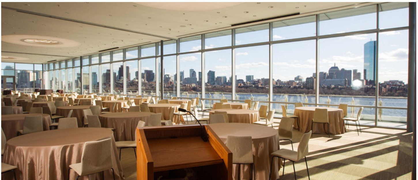
MIT's Samberg Conference Center features spectacular views of the Charles River and Boston skyline.