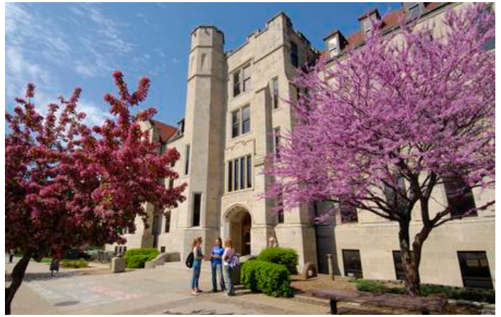
Since 2006, the Department has been located in Snow Hall.

Although the FBI was brought in to assist state, local and campus officials, the bombing was never officially solved. The computer facility was apparently targeted at that time because it housed KU's "nerve center" – a $3.5 million GE-635 that was not seriously damaged in the blast. The Lawrence Journal-World reported that a number of computer tapes stored in a rack on a wall blown apart by the explosion were destroyed, but added that "no tapes invaluable to university operations were in that location."